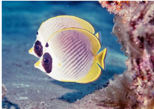
Indonesian butterfly fish (Chas Anderson)

Bali and Komodo are just two of the 17,000 islands that make up the archipelago of Indonesia, the largest in the world. This is a country born of fire, a region shaped over the millennia by huge tectonic forces and the slow, but inexorable, collision of the Indo-Australian and Eurasian Plates. From the tropical paradise of Bali a great arc of volcanic islands stretches to the east including Lombok, Sumbawa, Komodo and Flores. Some of these are now quiet, the heat from beneath having subsided long ago, whilst others still retain their internal furnace and awaken from time to time. All, however, lie in warm tropical seas, home to the most diverse marine-life anywhere in the world with over 3,500 species of fish (more than enough to keep the keenest snorkeller enthralled!) and a wonderful array of tropical whales and dolphins. On the islands themselves, an equally fascinating variety of birds and other wildlife may be found, including their most infamous inhabitant of all, the formidable Komodo Dragon, the largest species of lizard left on Earth! The wildlife that lives on this archipelago is of particular interest to the naturalist as it is here that the Asian fauna gives way to the Australasian wildlife, the boundary being marked by the famous 'Wallace Line' between Bali and Lombok.