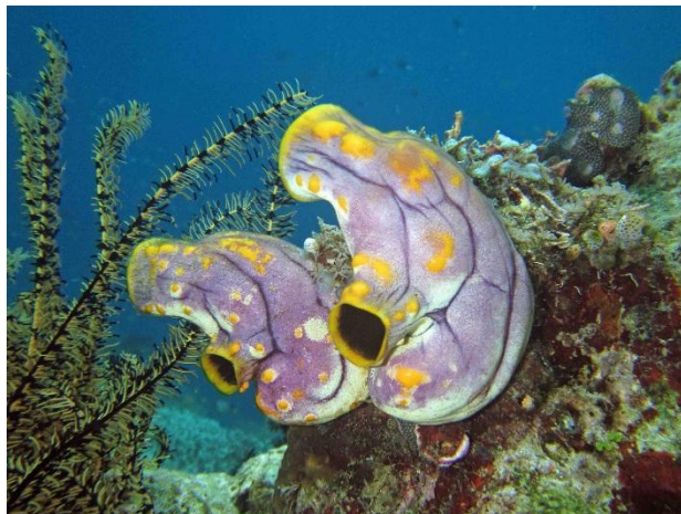
Sea Squirts