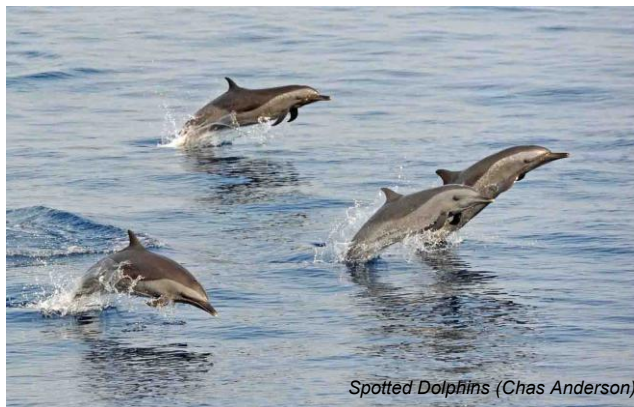
Spotted Dolphins (Chas Anderson)

We plan to board 'MV Mermaid I' in the early afternoon, at Benoa port located in the south of the island, and from there we begin our journey east. The exact itinerary for this cruise will be kept flexible to take account of such factors as the weather and wildlife sightings, benefiting from the unrivalled experience of Chas Anderson and his crew. As we travel from island to island we will stop to enjoy the scenery, cetaceans and other wildlife we meet along the way. Flying fish skitter away over the water's surface, whilst high overhead menacing flocks of Greater and Lesser Frigatebirds endlessly circle, occasionally joined by their rare Christmas Island cousin, while the beautiful Red-tailed and White-tailed Tropicbirds are also likely. We will travel by day and anchor early each evening in a sheltered spot to allow plenty of time for snorkelling and to appreciate the wonderful diversity of underwater life that abounds here, including, we hope, Manta Rays! Then, as darkness falls, far from the light pollution that blights so much of Western world, we can make our way up to the top deck of 'MV Mermaid I' to enjoy stunning views of the night sky.