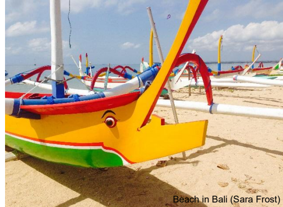
Beach in Bali (Sara Frost)

Following a change of aircraft, we are due to arrive on the palm-fringed island of Bali in the late afternoon, transferring from the airport to a beachfront hotel for our first night in the Indonesian archipelago. Bali is located at the westernmost end of the Lesser Sunda Islands, between Lombok and Java, and is just as exotic and beautiful as you would imagine! This evening will be a chance to relax and unwind after the long journey, or perhaps enjoy a first swim or snorkel in the warm sea.