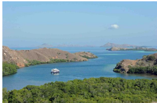
Komodo Dragon and MV Mermaid off Rinca