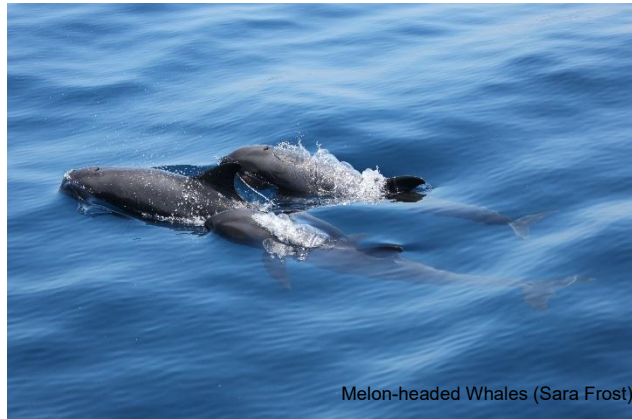
Melon-headed Whales (Sara Frost)

include False Killer Whale and Melon-headed Whale, plus Spinner, Spotted, Risso's and Fraser's Dolphins. Other possible species include Blue Whale, Cuvier's Beaked Whale, Dwarf Sperm Whale, Rough-toothed Dolphin and we will be keeping a sharp look out for the little-known Eden's Whale, a pending split from Bryde's Whale.