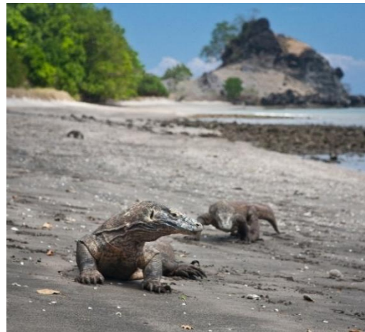
Komodo National Park (left) and Komodo Dragons (right)